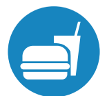
Fast food stores, bars & restaurants